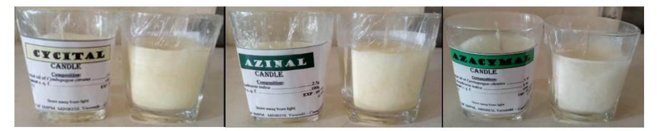
Figure 1: Illustration of the prepared candles