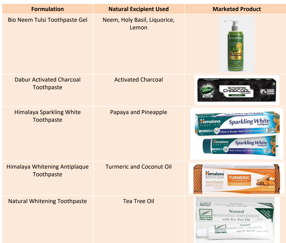
Table 2: Marketed Products