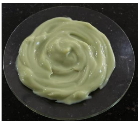
Figure 7: Emulgel containing TP Extract

The gel and the emulsion containing the extract of Tridax procumbens was mixed in 1:1 ratio and gently stirred to form the emulgel.