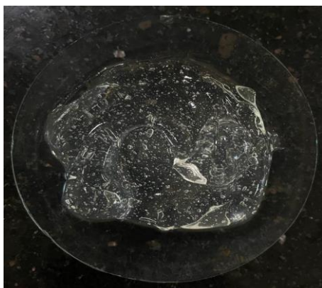
Figure 5: Gel base

swell. Methyl paraben sodium was dissolved in water. The Carbapol 940 was stirred continuously until no lumps are found. Then add 5-6 drops of Triethanolamine and methyl paraben sodium to the Carbapol 940 and stir continuously until a clear, transparent gel is formed.