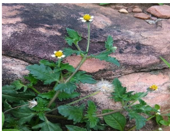
Figure 1: Tridax procumbens var. procumbens

T ridax procumbens Linn. Belongs to Asteraceae family. It is commonly known as 'Ghamra' and in English popularly called 'coat buttons' because of the appearance of flowers. The plant has been extensively used in Ayurvedic system of medicine for various disorders.