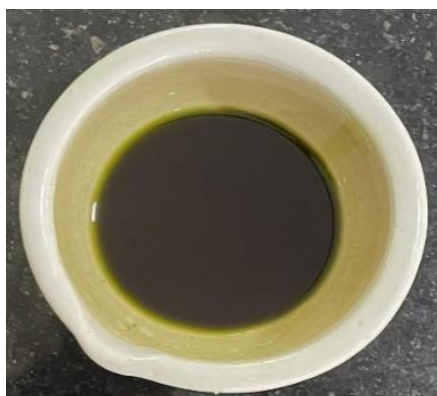
Figure 6: Emulsion containing TP Extract

The oil phase of the emulsion was prepared by dissolving Span 80 in Light liquid paraffin and the extract of Tridax procumbens was added and heated to 70°C. Methyl paraben was dispersed in oil phase. The aqueous phase was prepared by dissolving Tween 80 in purified water and heated to 80°C. The oil phase was slowly added to aqueous phase with constant stirring until stable emulsion was formed.