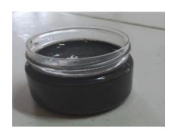
Figure 1: Formulated Herbal charcoal peel off mask

Consistency: It is smooth and light to spread.