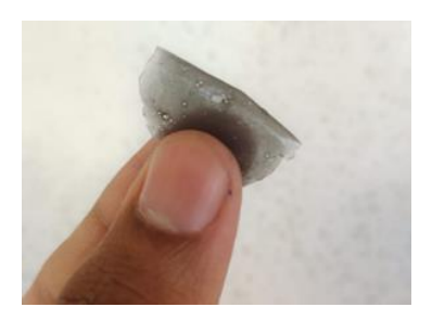
Figure 4: Folding Endurance

8. Folding Endurance: The number of times the film could be folded at the same place without breaking gave the exact value of folding endurance which was found to be 200 times.