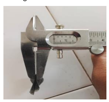
Figure 3: Vernier caliper

8. Folding Endurance: The number of times the film could be folded at the same place without breaking gave the exact value of folding endurance which was found to be 200 times.