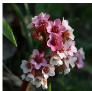
Fig 2: Bergenia ciliata flower