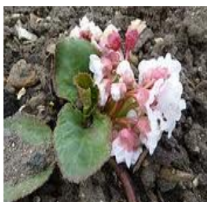
Fig 1: Bergenia ciliata whole plant

Bergenia ciliata leaves are suborbicular or broadly obovate, rounded at base and apex, margin finely denticulate and densely ciliata, leaves otherwise glabrous. Flowers green, lobes acute, denticulate near apex; petals obovate, white tinged pink. 2,3 Flowering time of Bergenia ciliata is February to April and fruiting time is March to July. 2,3