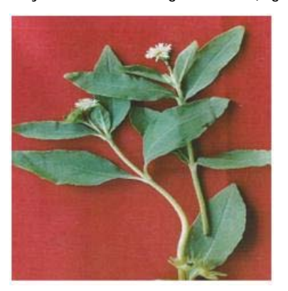
Figure 1: Eclipta alba L. (Hassk)

Clipta alba (L.) is an annual herb belonging to the family Asteraceae and is commonly known as false daisy. It is conspicuous in the Indian countryside as weed. The plant is erect or prostate with prolific branching, hairy stem and rooting at nodes (Fig. 1).