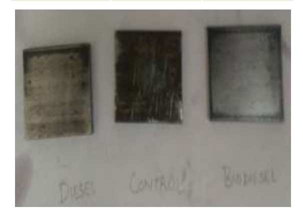
Figure 2: Comparison of anti-corrosive action of diesel, biodiesel and control.