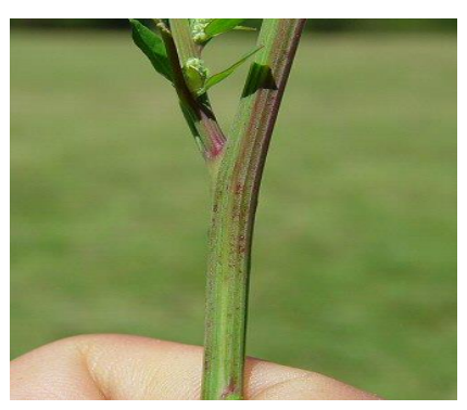
Figure 2: Stems of chenopodium album

Stems are rarely slender, angled, usually striped green, red or purple. Young stems are coated with a fine mealy pubescence, while older stems become more glabrous. (Figure 2).<sup>2</sup>