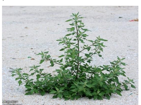
Figure 1:Chenopodium album herb

henopodium album Linn is an annual, 20-200 cm mealy white, erect, many-branched herb (Figure 1).<sup>1</sup>