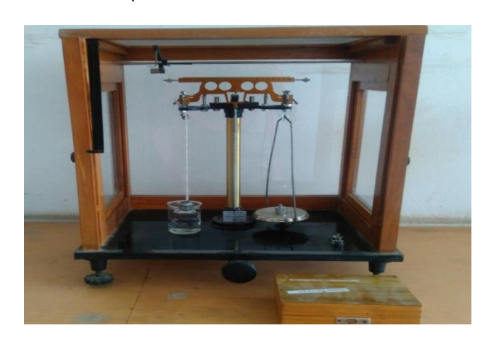
Figure 1: Modified physical balance for determination of bioadhesive strength of ocular insert