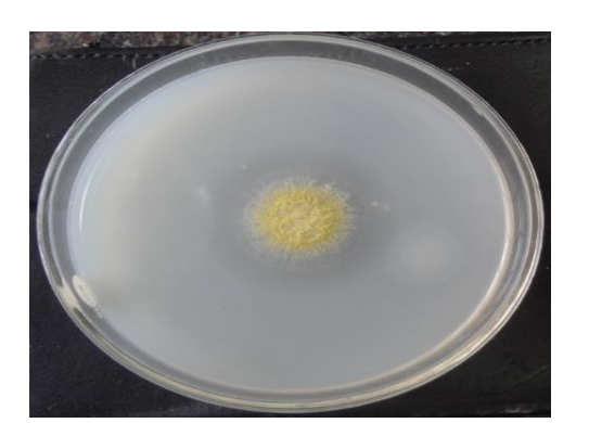
Plate 1: Plate assay of Aspergillus awamori KGSR12 mu