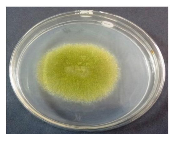
Plate 2: Aspergillus awamori KGSR12

The strain Aspergillus awamori KGSR12 (Plate-2) was induced through a physical mutation by subjected to UV radiation for enhancing the production of Alkaline protease. Aspergillus awamori KGSR12 (Plate-2) spore suspensions were prepared and were irradiated using a 15W Philips UV lamp at various distances (5, 20, 40, 60 cm) for 15 min<sup>32</sup>. The irradiated spore suspensions were inoculated on Czapek Dox agar plates. The present study deals with the parent strain and the best mutant strain which was isolated. The strain was labeled as Aspergillus awamori KGSR12 mu (Plate-3) and used for screening and production of alkaline protease.