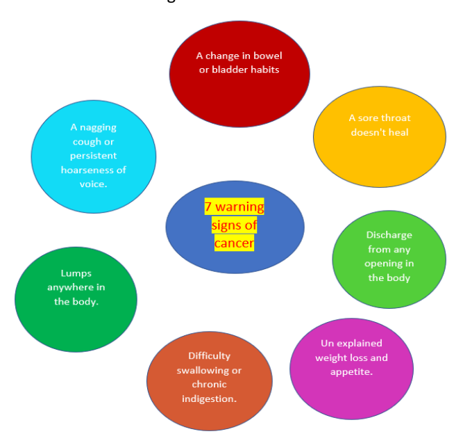
Figure 2: Signs of cancer

screening in India. The States in India are in various levels of health care delivery and health infrastructure, and there may be certain areas in which screening programs are significant, irrespective of the screening strategy. Signs of cancer is shown in Figure 2.