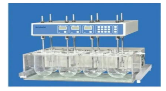
Figure 12: Biobase Bk-RC8 Dissolution Test