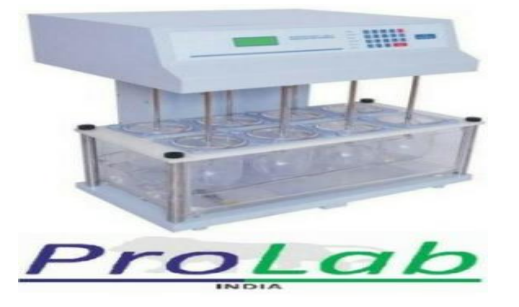
Figure 11: Rectangular Prolab India Tablet Dissolution Test Apparatus, Capacity: 8 Channel, Model Name/Number: Disso 8000 & Disso 6000