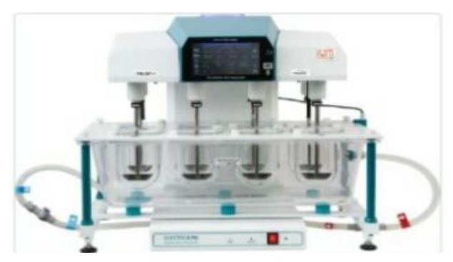
Figure 16: Tablet Dissolution Tester Model TrustE-8 Basic