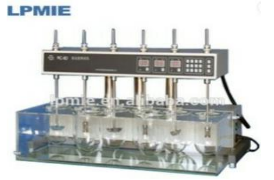
Figure 15: RC-6 Tablet Dissolution Test Apparatus Tester