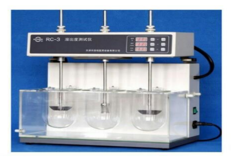
Figure 14: [Tianjin] RC-3 intelligent optical dissolution tester tablet capsule pharmaceutical RC-3D