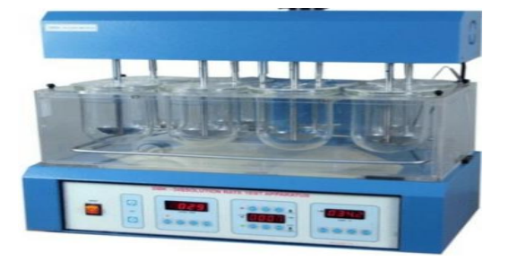
Figure 10: Tablet Dissolution Apparatus Model- Sigma 135

Figure 9: Electronics India Elec_1918 Microprocessor Dissolution Test Apparatus, 8 Station Model by Electronics India