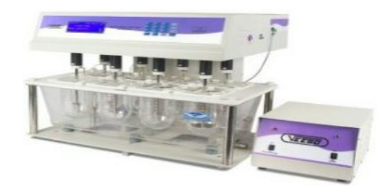
Figure 13: Microcontroller based dissolution test optical dissolution apparatus model: vda-8d

The f_2 value is equal to 100 when the test and reference profiles are identical and exponentially decreases as the two profiles become less similar. <sup>11</sup>