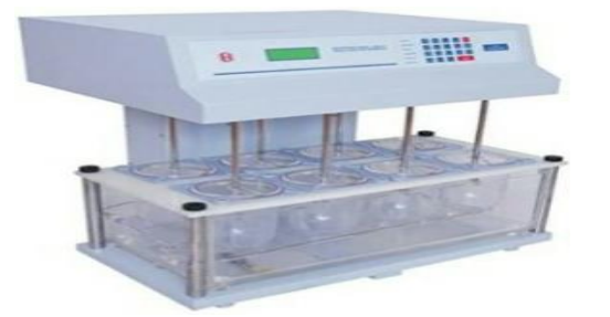
Figure 9: Electronics India Elec_1918 Microprocessor Dissolution Test Apparatus, 8 Station Model by Electronics India