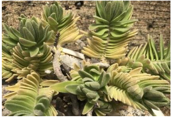
Figure 1: Plectranthus tenuiflorus leaves