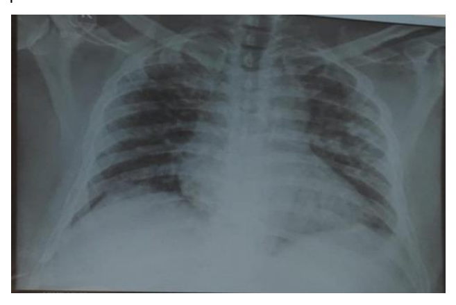
Figure 1: Chest X ray of patient 1

A 52-year-old male patient was admitted in hospital with low grade fever (100°F), complaints of cough and fatigability for past 7 days. No history of sore throat and dysuria. After the admission patient feel loss of taste functions. Patient has no travel history and no history of contact with positive covid 19 cases. Patient had a known case of varicose ulcer on Right foot and he is on regular treatment. On clinical examination patient was alert, on general examination pulse was 90 beats/min, RR: 24mins, SPO2 was 95% On room air, BP was 120/80 mmHg, temperature was 100 F. Rapid Antigen test for covid 19 shows positive and the patient was shift to the covid hospital for further management. Based on signs and symptoms, patient was under category B. Further lab investigation showed that patient Hb was 13.1gm/dL, Total count was 5,500cells/cumm, CRP was increased 20.30 mg/l, D dimer level was also increased 1347.97 ng/ml. On liver function test AST level was 26U/L ALT 27 U/L. On chest X RAY lung patches was noted, suggested of possible pneumonia infection.