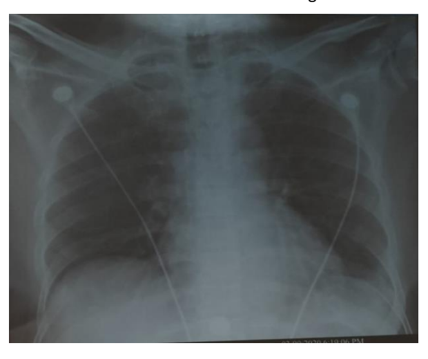
Figure 3: Chest X ray of patient 4

Further lab investigation showed that patient Hb was 11.2gm/dl, Total count was 6,300 cells/cumm, CRP was increased 98.70 mg/l, D Dimer level was also increased 1786.77 ng/ml. Serum ferritin was also increased 1421.69 ng/ml on liver function test AST level was increased 48U/L ALT 36 U/L and total bilirubin also increased 1.46 mg/dl. Blood culture shows Pseudomonas aeruginosa.