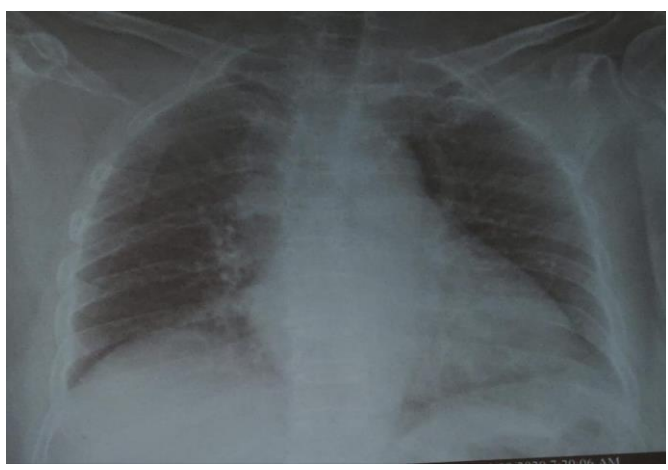
Figure 2: Chest X ray of patient 3