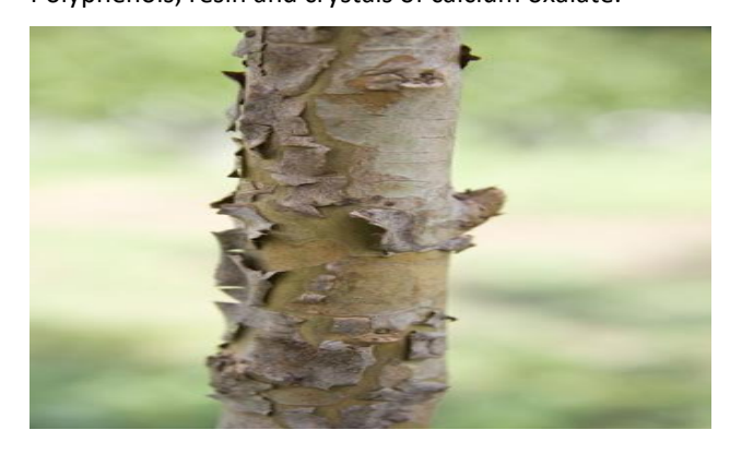
Figure 2: Bark

Polyphenols, resin and crystals of calcium oxalate. 12