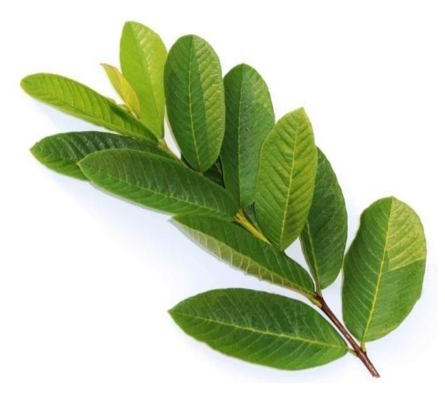
Figure 1: Leaves of Psidium guajava

contribution is less than Rs. 2000 crores at present. Raw drug exports from India gradually increased by 26% from Rs. 130 crores in 1991-92 to Rs. 165 crores in 1994-95. Annual raw material production from medicinal and aromatic plants is worth approximately Rs. 200 crores. This is likely to hit 1150 US dollars by the year 2000 and 5 trillion US dollars by 2050. Plant drugs have been shown to be in developed countries such as the United States, 25% of total drugs are accounted for, while the contribution is above 80% in fast developing countries such as China and India. Consequently, the economic In India, the significance of medicinal plants is much more than restoring the earth. These countries account for two thirds of the plants used in the modern medicine system, and the indigenous medicine systems have rural population health care systems. 3 The regulation of the immune response by the use of medicinal plant products as a potential therapeutic measure has become an active topic of scientific research .4