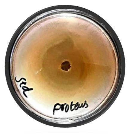
STD – Standard drug (Ciprofloxacin)

Antibacterial effect (zone of inhibition) of standard against proteus vulgaris (gram negative)