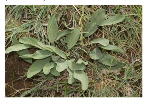
Figure 2: T. callophylla

specifically 13 species are found in Andhra Pradesh <sup>21-27</sup>. This plant is usually available in the form of shrubs.<sup>28</sup>