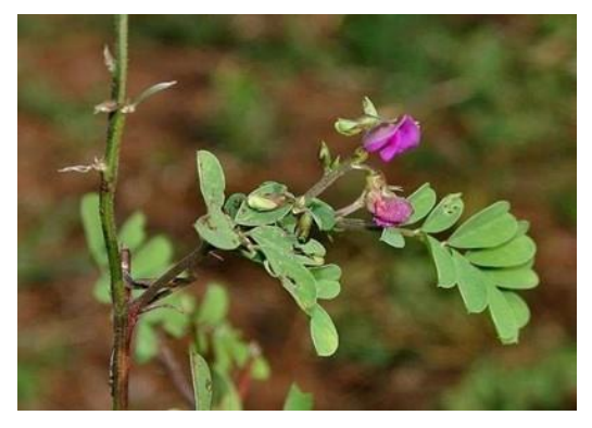
Figure 3: T. Purpurea

Tephrosia purpurea is a species of flowering plant in the pea family, Fabaceae, that has a pantropical distribution. It is a common wasteland weed. In many parts it is under cultivation as green manure crop. It is found in poor soils throughout India and shri lanka.