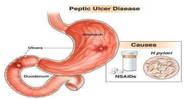
Figure 1: Peptic Ulcer Disease causes