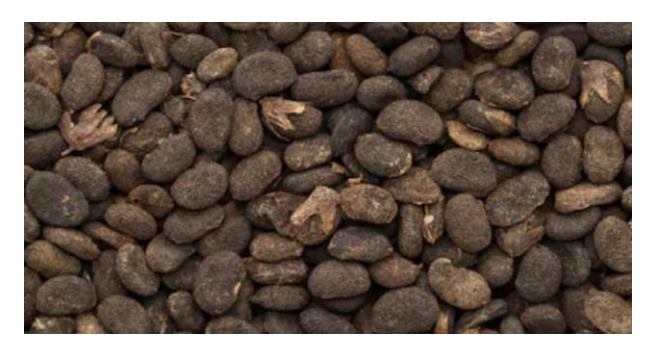
Figure 2: Psoralea corylifolia seed