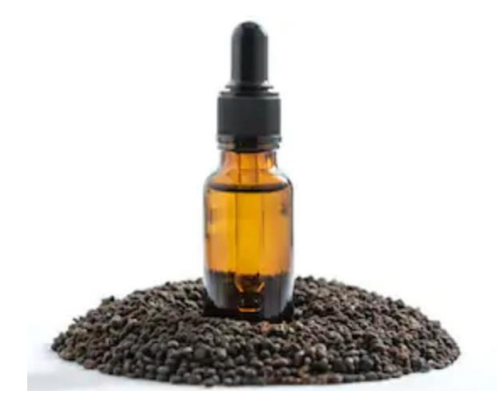
Figure 3: Psoralea corylifolia seed oil