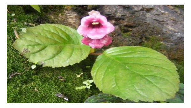
Figure 2: leaf and flower structure of Didymocarpus pedicellata in natural habitats