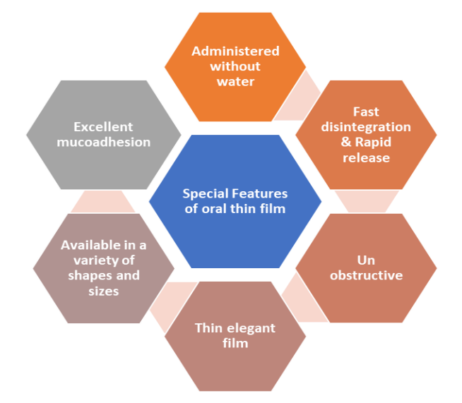
Figure 1: Special features of Oral thin film

After oral administration the drug should leave minimum or no residue in the mouth. ^{\rm 2}