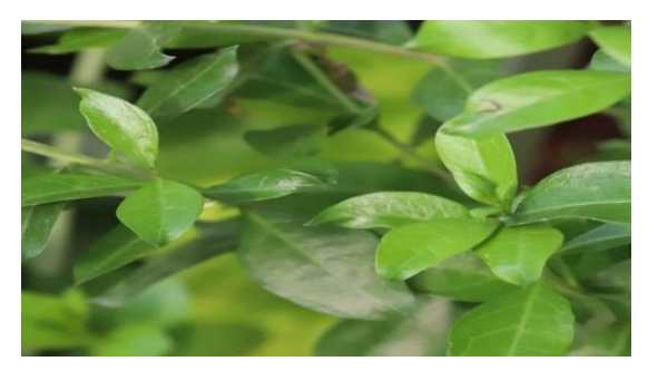
Figure 4: Henna leaves Image

Henna (Fig 4) has been used for quite a long time to dye hair and skin on hands and feet, especially of women. Henna is the most secure dye, which other then enhancing the appearance, also has therapeutic property to give hair a shiny, healthy look. The tattoos of henna do not have any results on skin either.