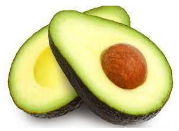
Figure 2: Avocado Fruit Image

The avocado (Fig. 2) oil has a rare vitamin D, known as the sun-ray nutrient which can nourish the skin. The oil has unusual property that infiltrates through the dermis and epidermis effectively to rejuvenate the skin from the inside. For those who have been denied of sunlight because of sickness, this herb proves to be a boon.