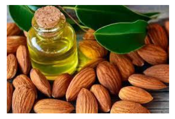
Figure 3: Almond Oil and Dry almond fruit

The almond oil (Fig 3) is one of the most secure oil that can be used in cosmetic products, since it has the less acidic reaction than any other oil. The oil has been utilized for skin protection against the dry and warm environment of desert regions. Almonds have special property to brighten the skin which is utilized in fairness creams.