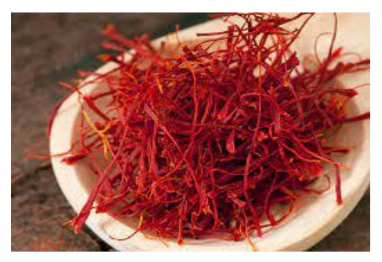
Figure 6: Saffron herb Image

Saffron (Fig 6) was viewed as quite possibly the most beneficial herbs for skin ailments and cleansing of skin by ancient Indian physician Charaka. The herb is utilized in cosmetics in production of fairness creams, cleansers and anti-blemish lotions.