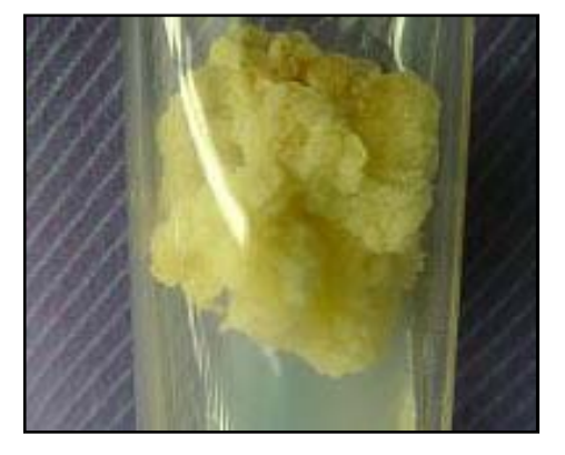
E. Hypocotyl Figure 1: Callus induction from different explants