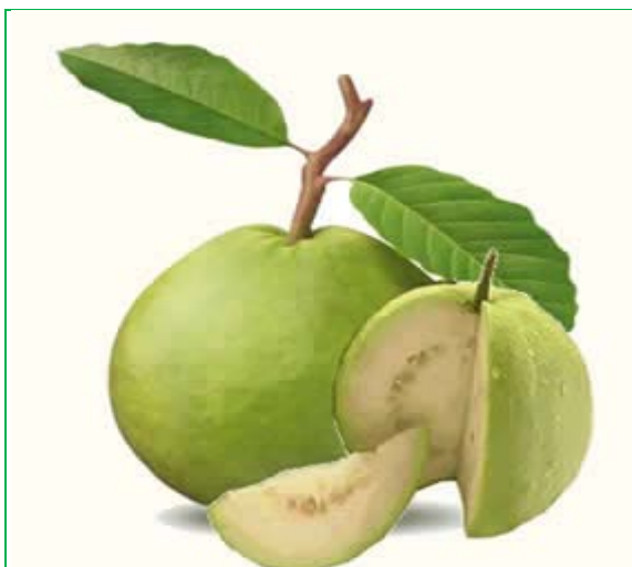
Figure 4: Psidium guajava L (Gauva)

Psidium guajava L (family Myrtaceae) is a fruit-bearing tree commonly known as guava. It is a low evergreen tree or shrub 6 to 25 feet high, with wide spreading branches and square, downy twigs, is a native of tropical America. 55 Guava trees have spread widely throughout the tropics because they thrive in a variety of soils, propagate easily and bear fruits quickly. The fruits are enjoyed by birds and monkeys, which disperse guava seeds and cause spontaneous dumps of guava saplings to grow throughout the rainforest. Cultivated varieties grow about 10 m in height and produce fruits within 4 years. Wild trees grow up to 20 m high and are well branched. The tree can be easily identified by its distinctive thin, smooth, copper-colored bark that flakes off, showing a greenish layer beneath.