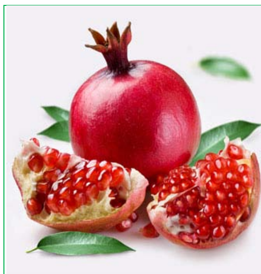
Figure 5: Punica granatum (pomegranate)

Punica granatum (Family Punicaceae) is commonly known as Pomegranate, Granada (Spanish), Grenade (French). It is an attractive tree that grows up to 5 m in height. The pomegranate is native from Iran to the Himalayas in northern India and was cultivated and naturalized over the whole Mediterranean region since ancient times. It is widely cultivated throughout India and the drier parts of Southeast Asia, Malaya, the East Indies and tropical Africa. The tree was introduced into California by Spanish settlers in 1769. Pomegranates prefer a semi-arid mild-temperate to subtropical climate and are naturally adapted to regions with cool winters and hot summers. It is usually deciduous, but in certain areas the leaves will persist on the tree. The trunk is covered by a red-brown