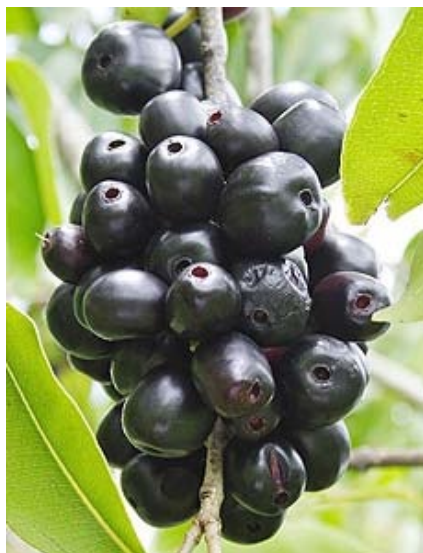
Figure 2: Eugenia jambolana (Jambul, Jamun)

Eugenia jambolana (Family Myrtaceae) is also known as Syzygium jambolanum and Syzygium cumini . It is an evergreen beautiful tropical tree, native to India, Pakistan and Indonesia. Other common names are Jambul, Black Plum, Java Plum, Indian Blackberry, Jamblang, Jamun etc. It grows readily in other tropical climates and has been carried to eastern Africa, Brazil, and Southeast Asia. The tree grows fast and reaches heights of up to 30 m and can survive for more than 100 years. Leaves of this tree are smooth, glossy, oblong and placed opposite to one another having a turpentine smell. Its wood is strong and water resistant. The trees start flowering from March to April. The flowers are greenish-white in color, small and fragrant. The fruits are ripe in June and the fruit is oblong. It turns from green, to pink to shining crimson black as it ripens. The taste of the fruit is sweet and sour. Raw fruits are used for making wine and vinegar. The juice of ripe fruit is used for preparing jams, jelly, sauces and other beverages.