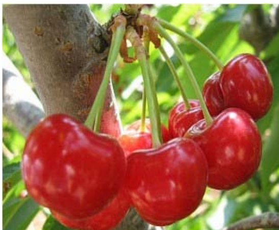
Figure 1: Prunus cerasus (Tart Cherries)

Prunus cerasus (Family Rosaceae) is also known as sour cherry, pie cherry, tart cherry, montmorency cherry, balaton cherry etc; they are the smallest members of the stone fruit family. Cherries are typically classified as either sweet or tart. Sweet cherries include Bing cherries, Lambert cherries, and Rainier cherries and are grown mainly in Washington, Oregon and Idaho. Tart cherries include the Montmorency and Balaton varieties and are produced primarily in Michigan. Both sweet and tart cherries and cherry juice have long been used by traditional healers as a folk remedy for gout 12 , because cherries are thought to lower urate levels in the body. Tart cherries are used for conditions involving inflammation and pain, such as: arthritis, muscle pain, back pain, diabetes. Both sweet and tart cherries contain phenolics, a naturally-occurring plant compounds that have anti-inflammatory 13 and antioxidant effects 14 . The main type of phenolic in cherries is called anthocyanins. In general, the darker the cherry color, the higher the anthocyanin content.