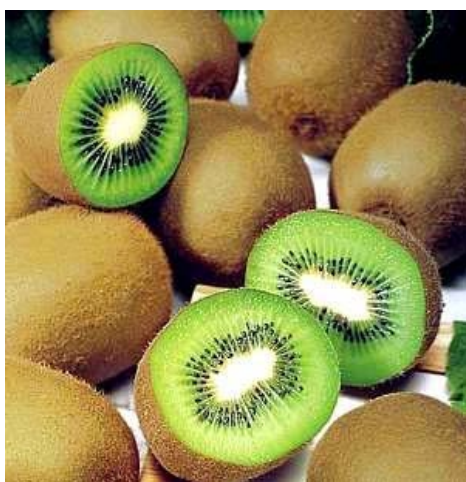
Figure 3: Actinidia deliciosa (kiwi fruit)

Actinidia deliciosa (family Actinidiaceae ) is an edible berry and is the "National Fruit" of the People's Republic of China. The most common cultivars of kiwifruit are oval, about the size of a large hen's egg (5–8 cm / 2–3 in long and 4.5–5.5 cm / 1¾–2 in diameters). It has a fibrous, dull brown-green skin and bright green or golden flesh with