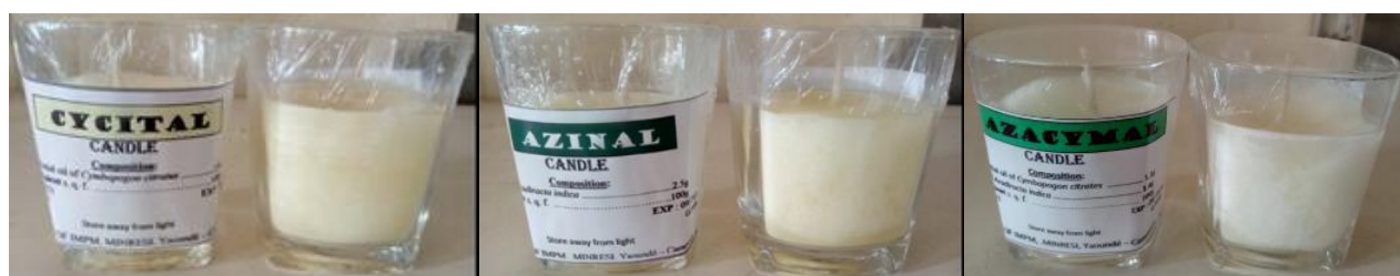
Figure 1: Illustration of the prepared candles