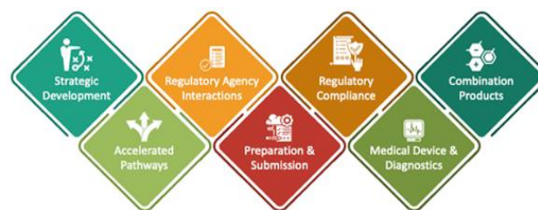
Figure 1: Regulatory Affairs