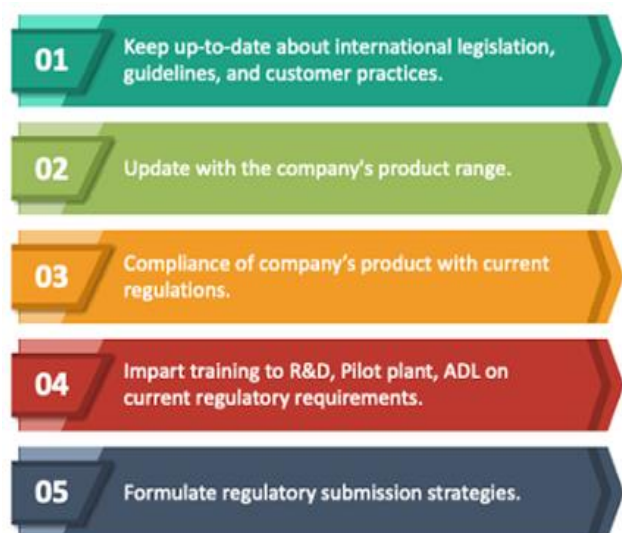
Figure 4: Responsibilities of Regulatory Affairs

The responsibility of the regulatory affairs specialist is to stay abreast of the constantly evolving legal framework in every area where the company plans to sell its goods. They also offer advice on the limitations and obligations imposed by law and science and gather, compile and assess the scientific information that their colleagues in research and development are producing. They are in charge of presenting the registration. Fig 4 represents Responsibilities of Regulatory Affairs.