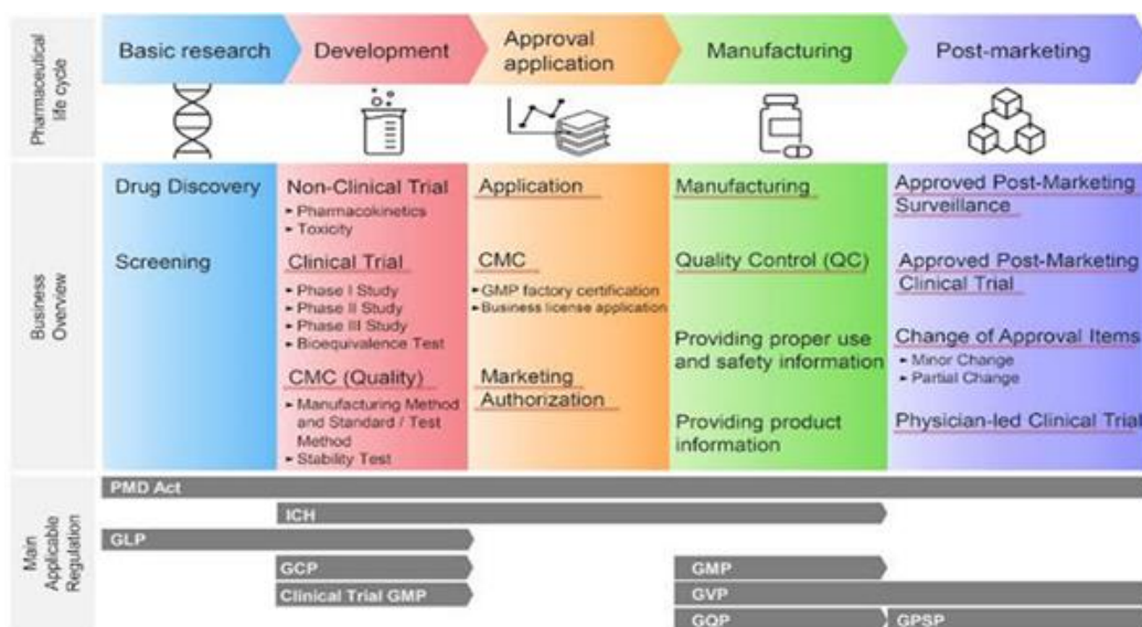
Figure 2: Drug Development process