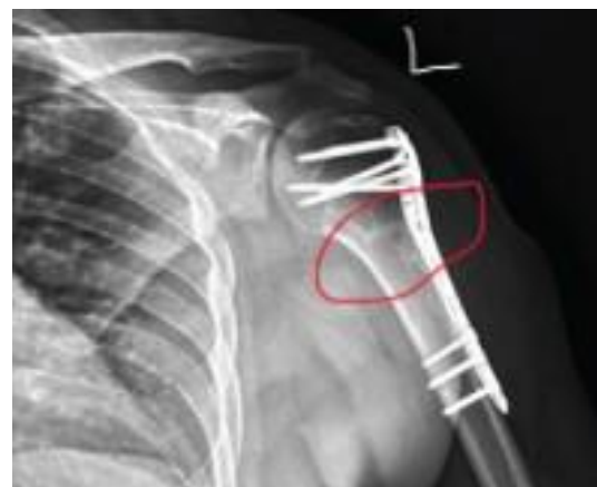
Figure 2: Antero-Posterior Radiograph of 1-Year Follow Up of a Patient aged 26 Years Showing Good Union