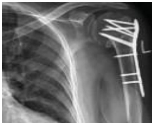
Figure 3: Antero-Posterior Radiograph of 2-Year Follow Up of a Patient aged 55 Years Showing Varus Malunion