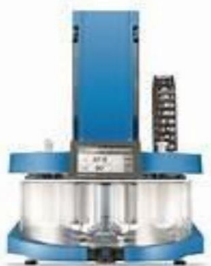
Figure 2: Wintergreen chewing apparatus