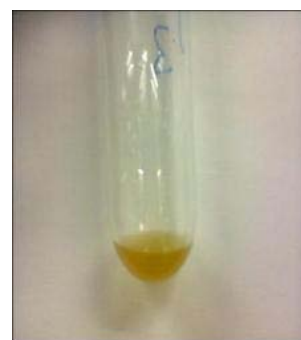
(a) crude extract

The quantitative determination of total flavonoid content of the extracts was expressed as percentage of catechin per 10 ml of aqueous extract showed the content values of 10.8 w/v. While for total tannin content, expressed as mg tannic acid equivalents and per 10 ml of sample showed the content values of 6.2 w/v. The result showed that aqueous extract of M. malabathricum leaves contain less tannin than flavonoids. It may be due to the solubility of the tannin in aqueous solution is less than flavonoids. The flavonoids has more hydroxyl group (free hydrogen) to be attracted and extracted in water. 4