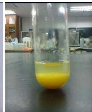
(c) tannin test

Figure 1: The phytochemical screening test of flavonoids and tannin in the aqueous extract of M. malabathricum leaves. (a) crude extract before added any indicator; (b) crude extract was mixed with NaOH; (c) crude extract was mixed with lead acetate. The quantitative determination of total flavonoid content of the extracts was expressed as percentage of catechin per 10 ml of aqueous extract showed the content values of 10.8 w/v. While for total tannin content, expressed as mg tannic.