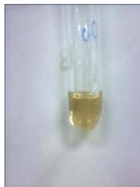
(b) flavonoids test