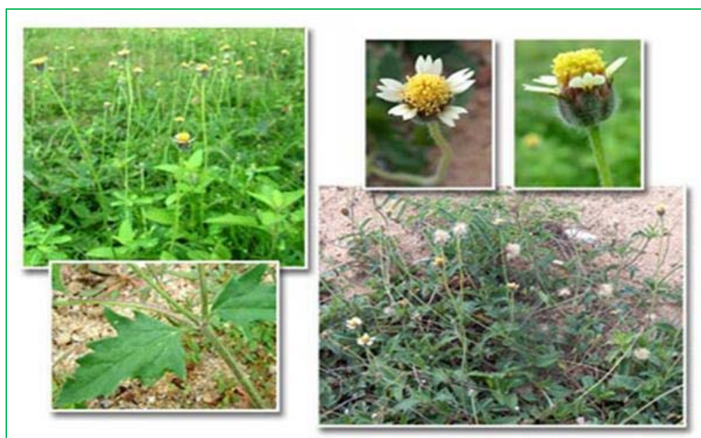
Figure 1: Tridax procumbens