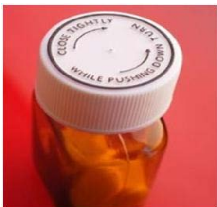
Figure 2: Child resistant closures

Child resistant closures help to significantly reduce the chances of a child accessing a drug or chemical. They are legally required on some medication and chemicals, and can be purchased from pharmacies for use on other