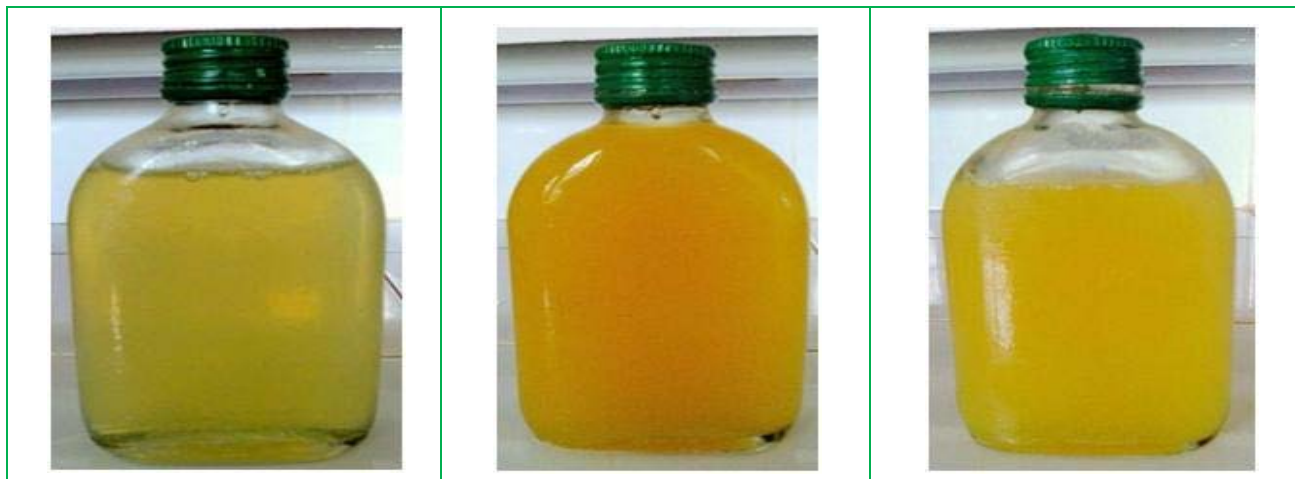
Black pepper syrup