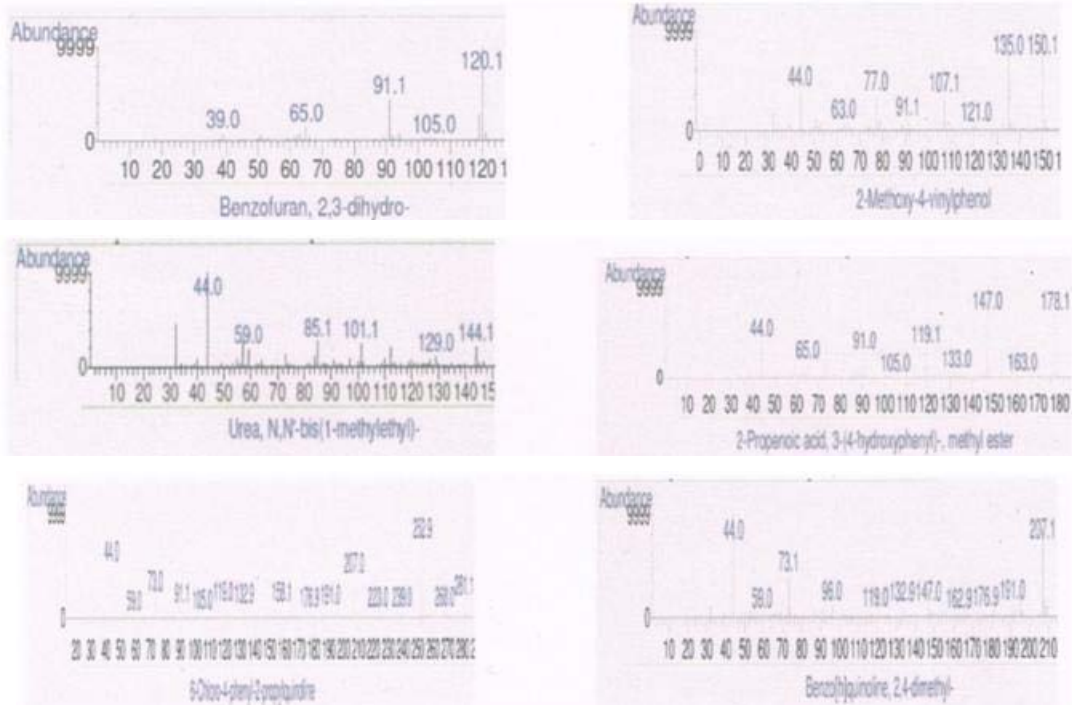
Figure 3: Mass spectrum of phytochemicals identified in C. reflexa grown on C. fistula