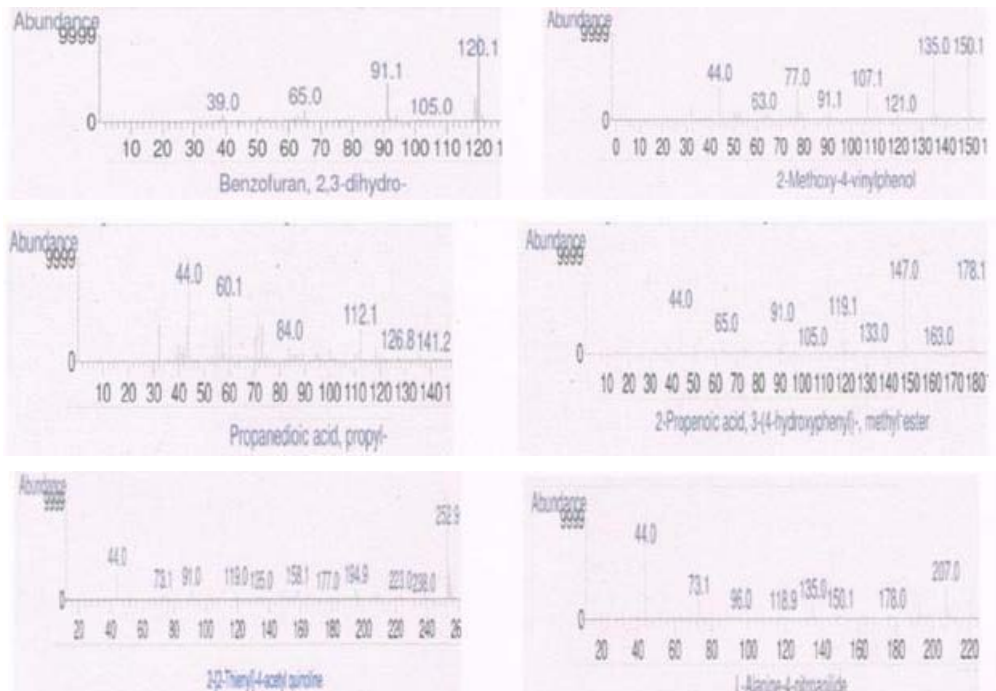
Figure 4: Mass spectrum of phytochemicals identified in C. reflexa grown on F. benghalensis