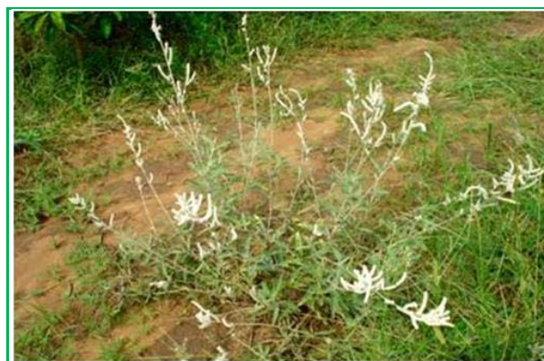
Figure 1: Aerva javanica undershrub