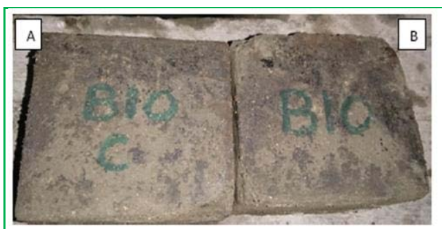
Figure 3: Bioconcrete of size 50mm cubes (A) CONCRETE (NO BACTERIA) (B) BIOCONCRETE (BACTERIA)