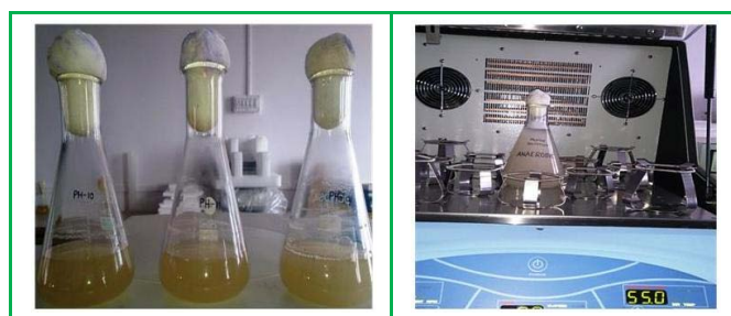
Figure 2: Marine bacterium growth at PH 12 (high alkaline) and Temperature 55 °C under aerobic and anaerobic condition