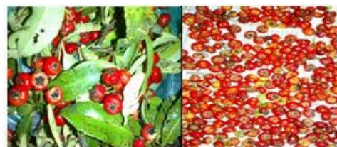
Pyracantha crenulata leaves & fruits