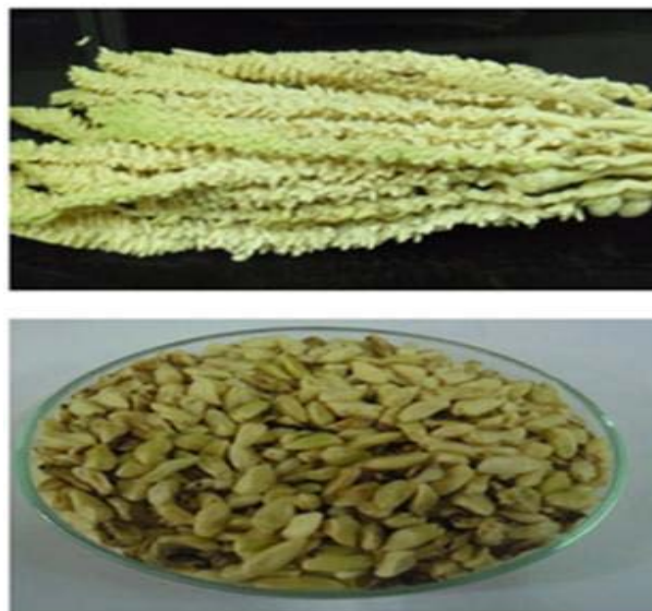
Plate 1: Cocos nucifera flowers

The flowers of Cocos nucifera used for the present study is depicted in Plate 1.