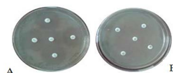
A: Streptomycin B: Ampicillin