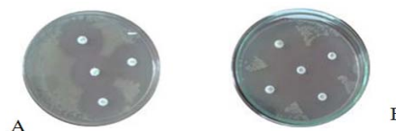
A: Streptomycin B: Ampicillin

The figure displays susceptibility of P. aeruginosa to Streptomycin; resistance towards Ampicillin.