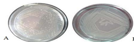
A: Escherichia coli B: Pseudomonas aeruginosa

concentrated essential oil by adopting disc diffusion method of screening. The antibacterial activity observed was compared with standard antibiotics such as Ampicillin and Streptomycin.