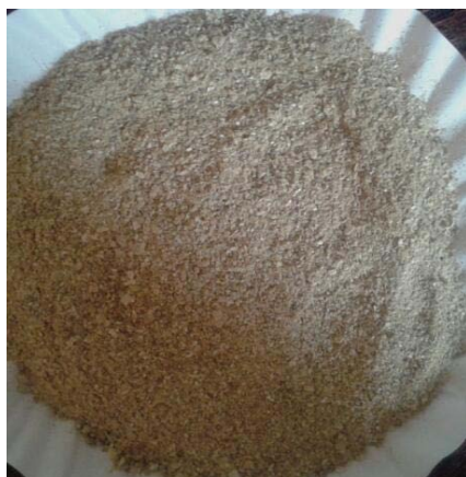
Figure 1: Groundnut shell powder

size sieve to get uniform particle size distribution of adsorbent. Then it was stored.