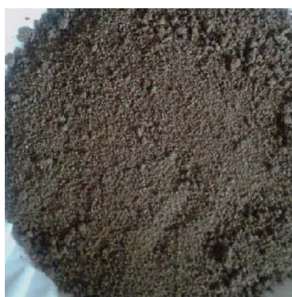
Figure 2: Spent Tea Waste powder