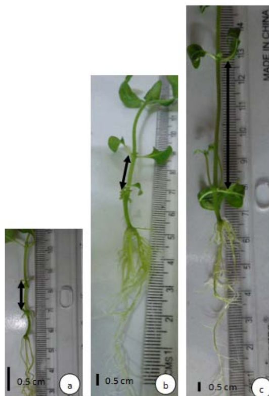
Photo 2: seedlings stemming from development of leafless node (a), node with single leaf (b), node with two leaves (c)

The number of root ( 6.40^c \pm 1.57 roots / plant) initiated by the nodes with two leaves was significantly different from that obtained with leafless nodes ( 4.35^a \pm 1.46 roots / plant). Even in the presence of IBA at 0.1 mg/L, the number of roots obtained with the leafless nodes ( 5.60^{bc} \pm 1.35 roots / plant) was significantly different from that obtained with leafy nodes cultured on medium without phytohormone. It was noticed that without exogenous auxins (IBA), the number of roots and their length by plant was a function of the presence of leaves on the nodal explants (Table 1).