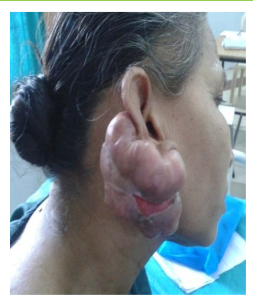
Figure 1: Right side earlobe showing a giant keloid with an ulcer over the surface.