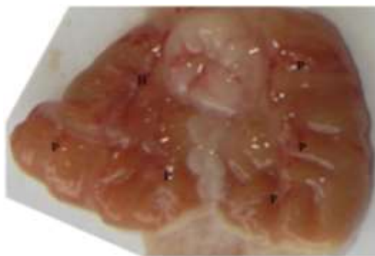
Plate 2: The effect of ethanol (80 %) on gastric mucosa in animal pretreated with ranitidine (150 mg/kg).

Photograph showing longitudinal hemorrhagic bands (H) in the glandular part of the stomach.