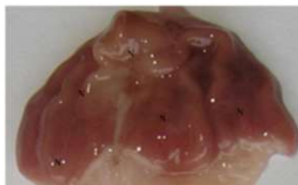
Plate 3: The effect of ethanol (80 %) on gastric mucosa in animal pretreated with MEPO (150 mg/kg).

Photograph showing a single longitudinal band (H) with preponderance of preteichial lesions (P) in the glandular part of the stomach.