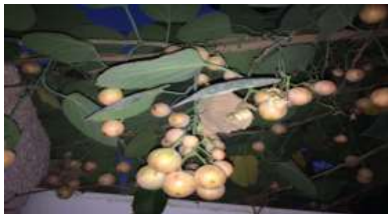
Figure 1: Fruiting twig of Cordia myxa

environment and estimation their activity as Anti-bacterial.