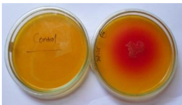
Figure 2: L-Glutaminase showing pink colour zone