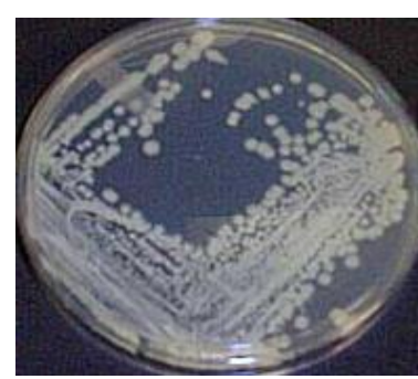
Pure Culture of BT 07