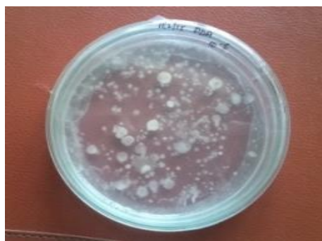
Isolates of Bacteria