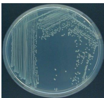
Pure Culture of BT 06