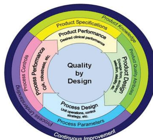
Figure 1: QbD Fingerprint