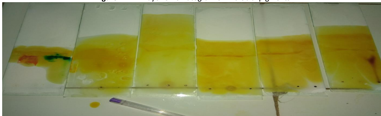
Figure 2: Thin Layer Chromatogram of microbial pigments

From left to right, every plate has 3 samples