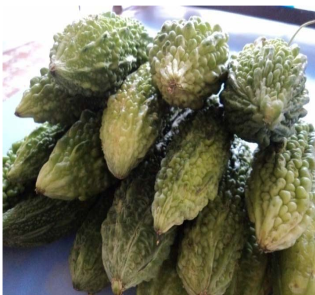
Figure 3: Fruits of Momordica Charantia