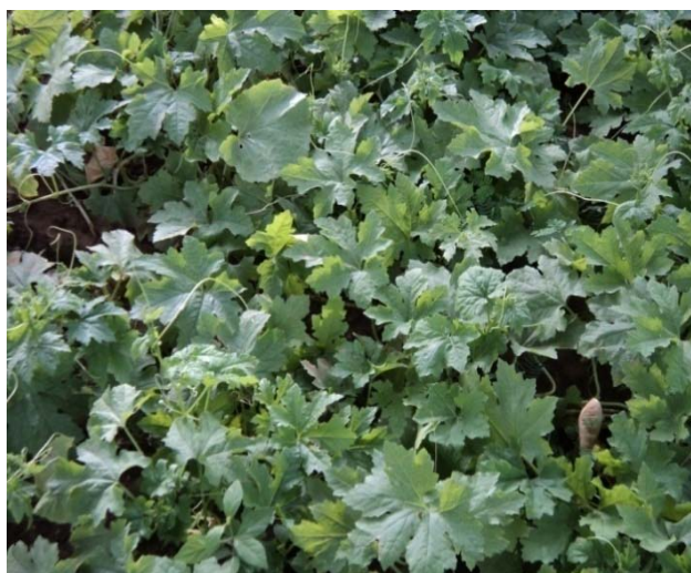
Figure 2: Leaves of Momordica Charantia