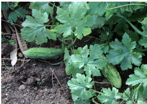
Figure 1: Plant of Momordica Charantia bearing fruits

In India, it has typical morphology i.e. narrower shape, pointed ends and surface covered with jagged, triangular “teeth” and ridges with green coloration. It has a strong bitter taste among all vegetables 12 .