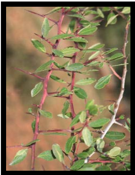
Figure 2: Stem of the Gymnosporia Montana

G. montana is circular and exhibits epidermis, cortex, phloem, xylem and pith as shown in figure 3. Epidermis is composed with many layers of compact, thin walled square to rectangular cells. Cortex is made up of elongated parenchymatous cells. A band of yellowish colored matter, starch grains and cluster crystal of calcium oxalate. Inner cortex has a broken pericyclic fiber with square to rectangular stone cells. Phloem is consists of sieve tubes, sieve plates, companion cells, phloem parenchyma and fibers, phloem cells with dark matter and calcium oxalate crystals. Xylem vessels are narrow, single and radially arranged. Xylem and phloem are traversed by uniseriate medullary rays, the cells of which round and parenchyma in nature, filled with dark colored matter. Pith is composed by parenchymatous with round cells containing many rounds, single starch grains, dark colored matter and few prismatic as well as cluster crystal of calcium oxalate. Cells at the center of pith are larger than those towards the periphery.