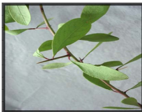
Figure 1: Gymnosporia Montana

Young stem pieces of G. montana are reddish brown as shown in figure 2, round and hard. Its cut end is white and granular. Spines are straight, hard and pointed. They are modified branches and show a single node from which leaves are originates. Flowers are small, white, born in axillary cymes. Bracts are small, acute. Fruits are broadly obovoid, 10-12 mm long and 8-9 mm in diameter. The peak flowering from in the month of October to December while, fruiting between the months of January to April in India.